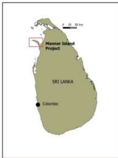
Figure 1 Mannar Project area, pre 2016 and current Srinel Holdings Ltd auger drilling.